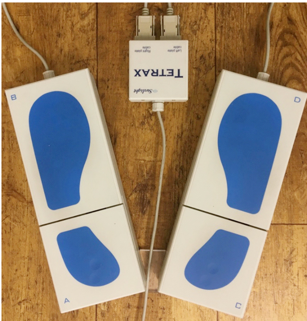
Fig. 2. Interactive Balance System consisting of four independent force plates.