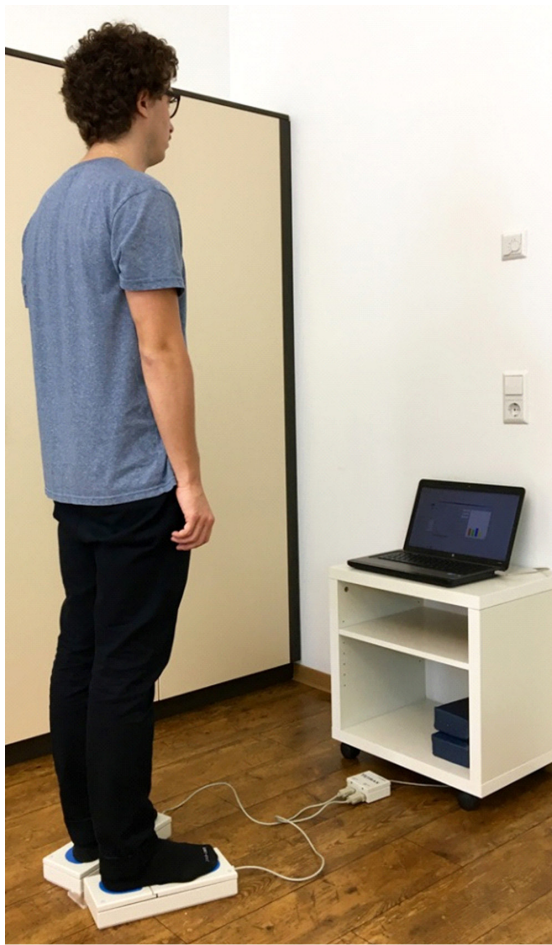
Fig. 3. Assessment of postural regulation and stability characteristics using Interactive Balance System.